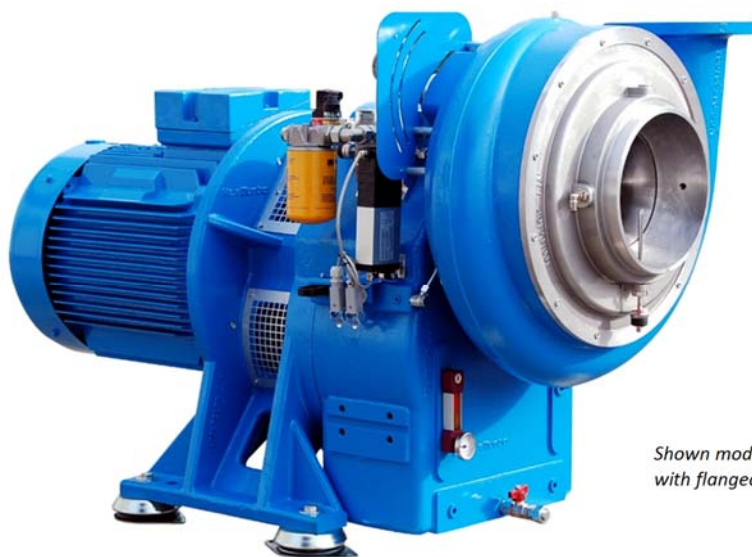
Shown model in B5 console configuration with flanged motor