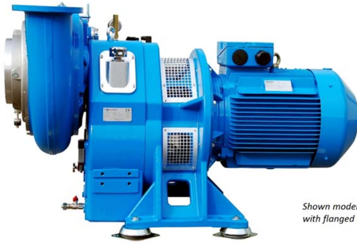
Shown model in B5 console configuration with flanged motor